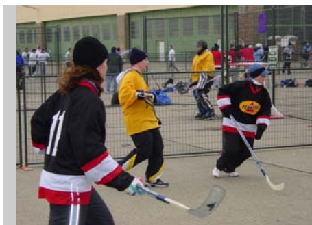
Pennzoil vs Brampton Spirit